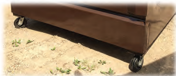
6" Casters Shown